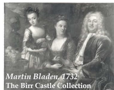
Martin Bladen, 1732 The Birr Castle Collection

Established in 1696 to replace the Lords of Trade (1675-96), the Board of Trade advised on and supervised the British Empire's colonial affairs. The Board of Trade examined colonial legislation to ensure maximum benefit to British trade policies, nominated colonial governors,