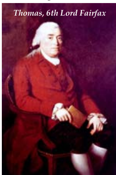
Thomas, 6th Lord Fairfax