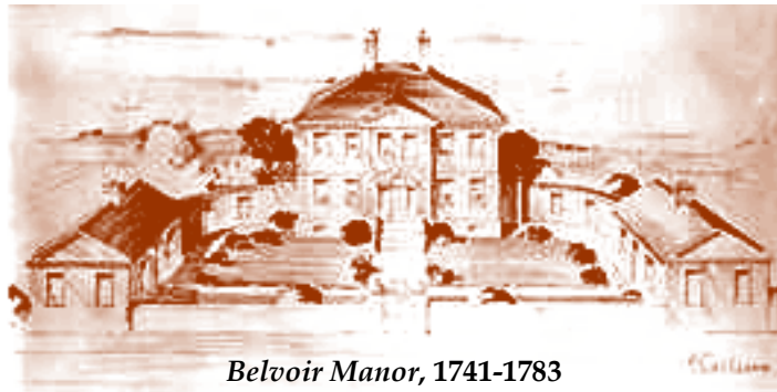
Belvoir Manor, 1741-1783